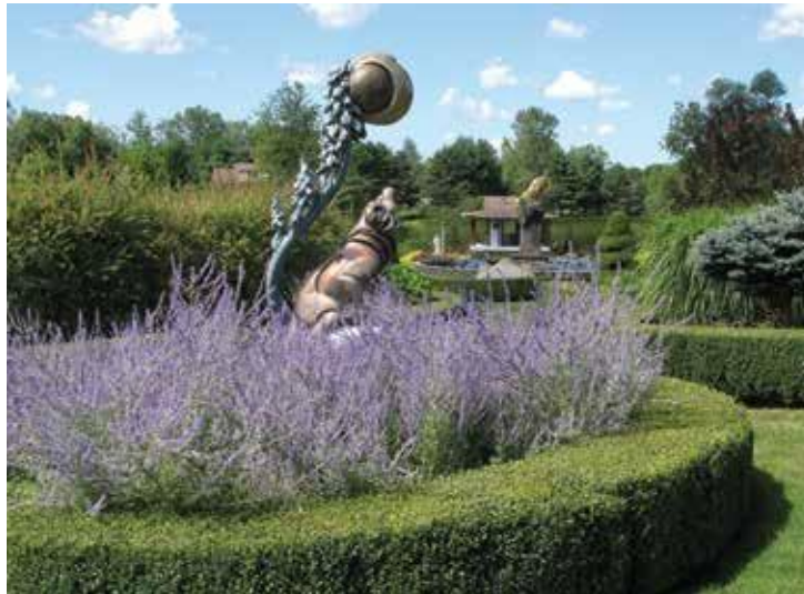
surrounded by pitch perfect greenery composed of more than 4,000 plants and trees, Moonlight Howls is a howling landscape success at Tupper Gardens. In the distance, sculptures Precious Cargo and Poetic Gestures , also by Jason Napier, create ambiance within the landscape.

An artful space can be a powerful experience for the viewer, so be purposeful. "A sculpture garden creates an oasis that combines natural elements with art that touches